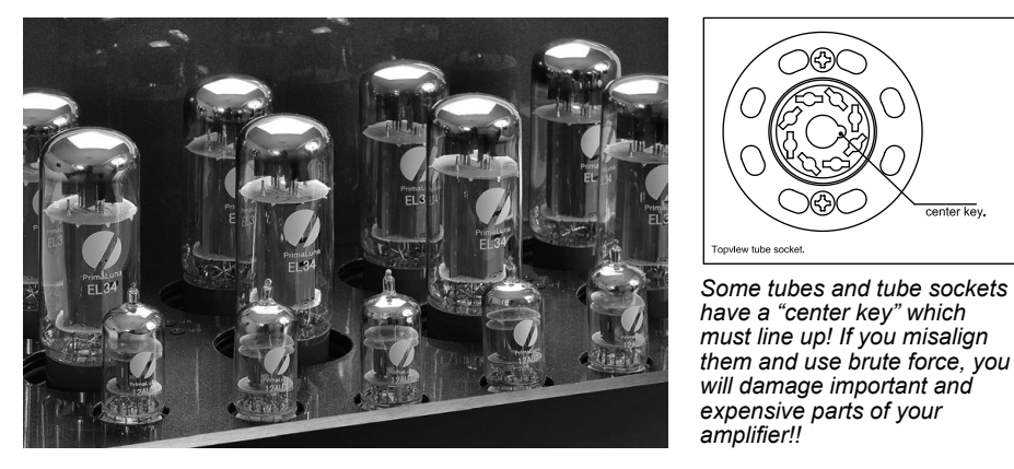
Top view of DiaLogue Premium HP Poweramplifier