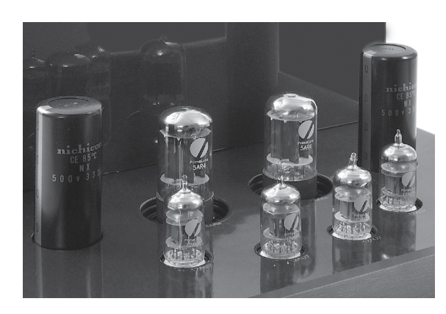
Topview hube sockets Some tubes and tube sockets have a "center key" which